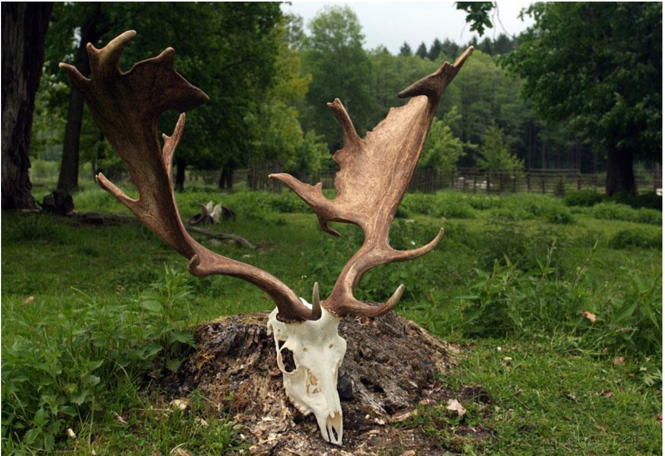
FALLOW DEER 222,29 CIC (2013)