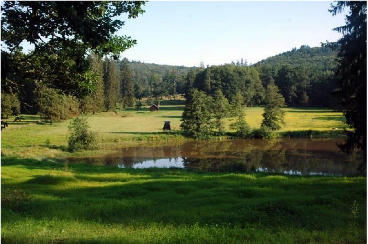
A pond in the hunting grounds