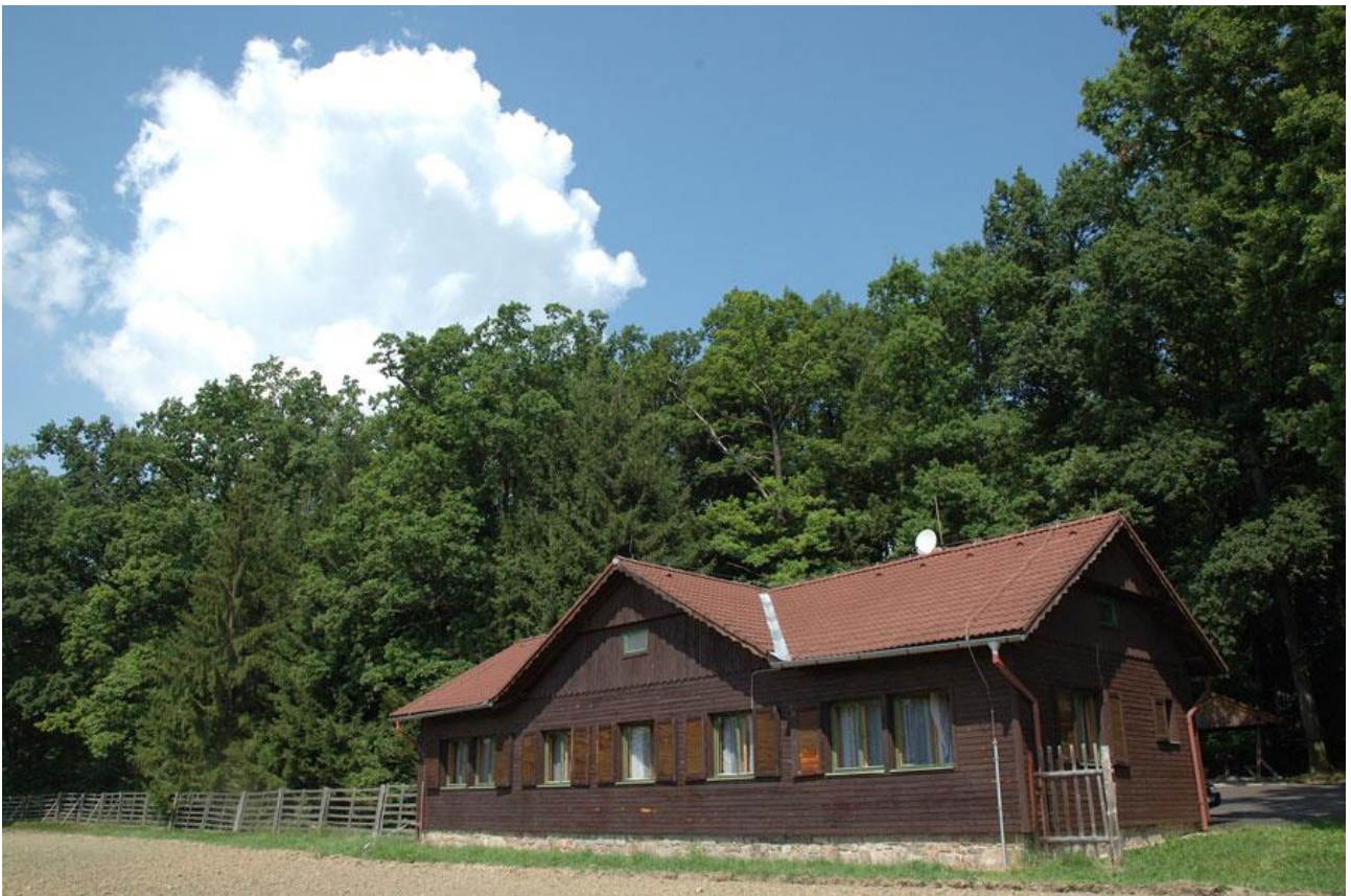
Hunting Lodge in Game Preserve N. 1

A very pleasant accomodation is assured by a hunting lodge with 6 beds, an apartment with 4 beds, guest houses and hotel-chateau near the hunting grounds (up to deluxe level). The accommodation prices in the hunting lodge are the following: