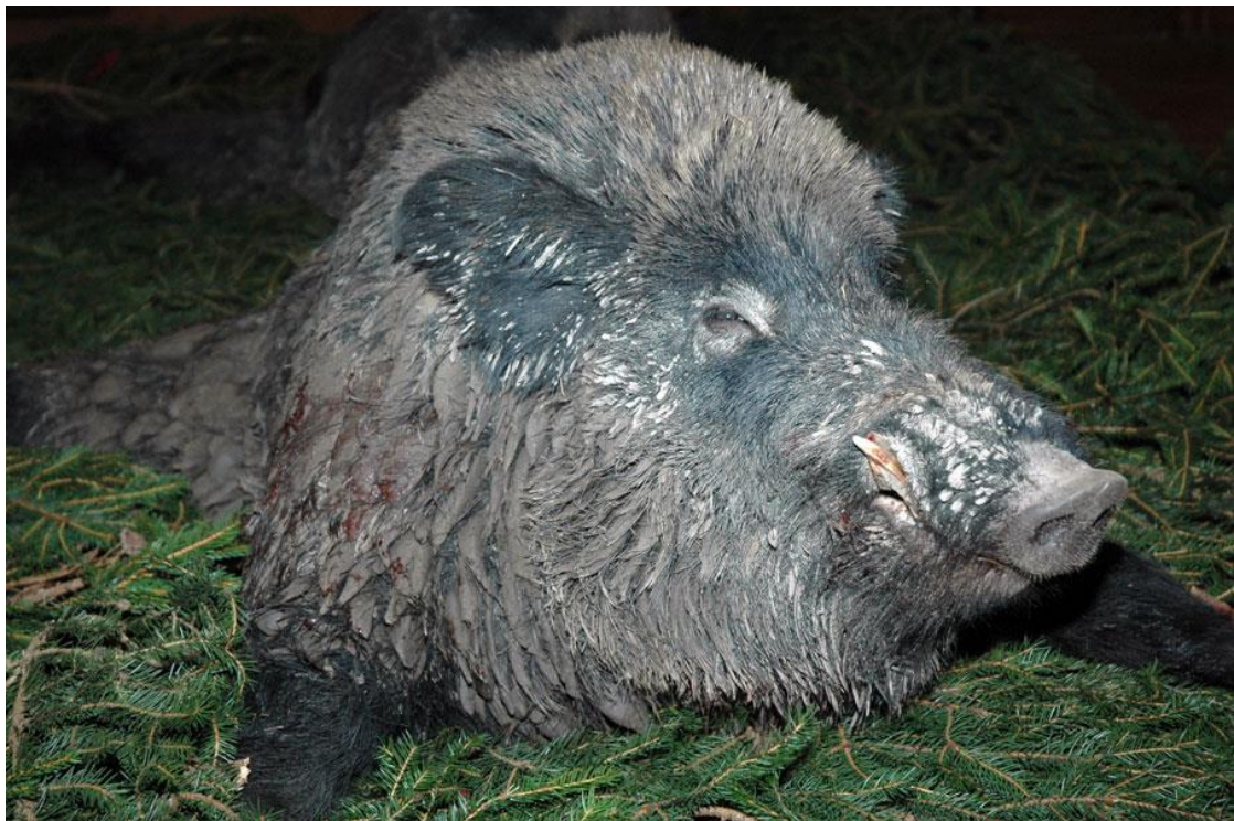
WILD BOAR HUNTED IN 2014