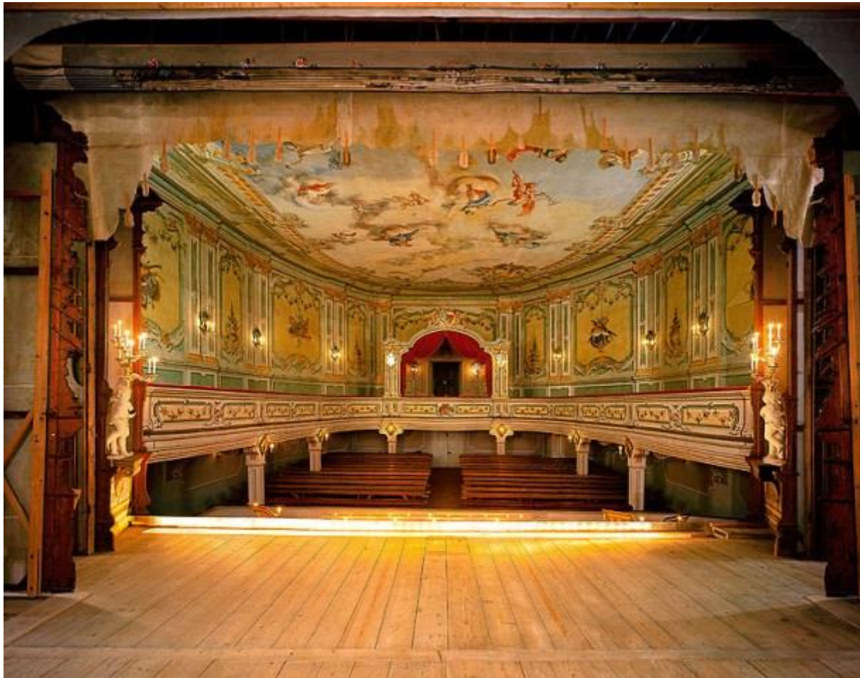
Český Krumlov Theatre

Krumlov's attractions is its Baroque theatre, which is one of the oldest preserved chateau theatres in Central Europe. Alongside the theatre building itself, visitors can view hundreds of decorations, costumes, and props, as well as an orchestra pit, theatre machinery and an extensive collection of original scripts. The theatre serves only as a working theatre museum today. However, a unique revolving auditorium, set against the natural backdrop of the Castle Park, offers unforgettable theatre performances beneath the night sky.