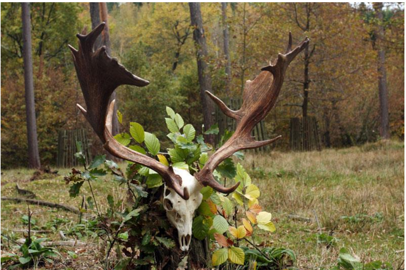
FALLOW DEER 222,63 CIC POINTS (2014)