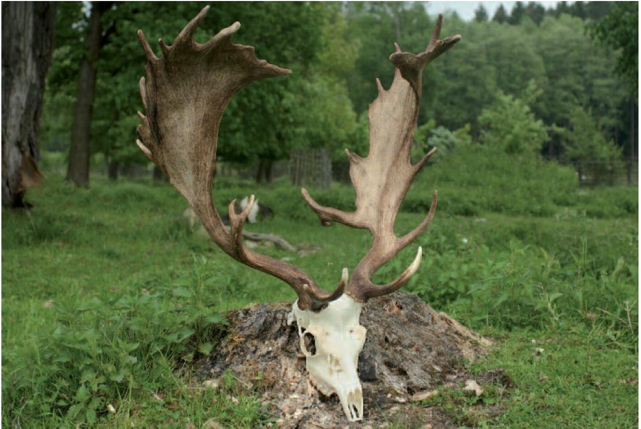
Fallow Deer 222.29 CIC POINTS