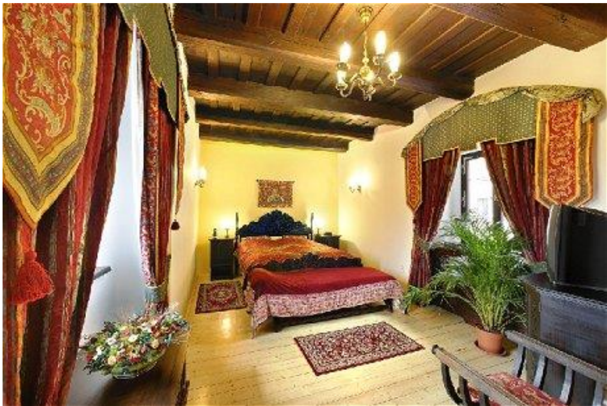
ROOM OF 5 STAR HOTEL