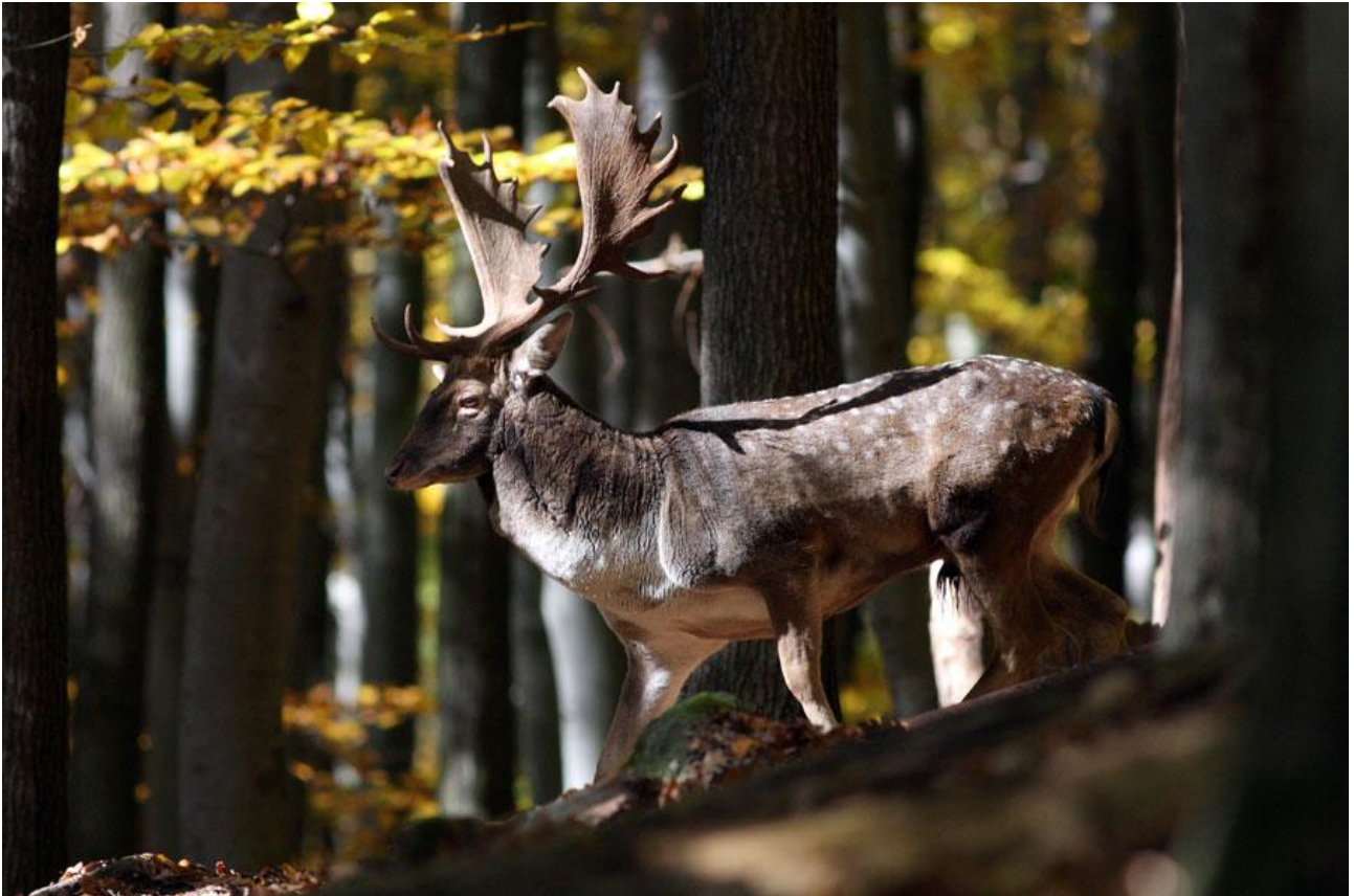
A Fallow Deer in Game Preserve N. 2