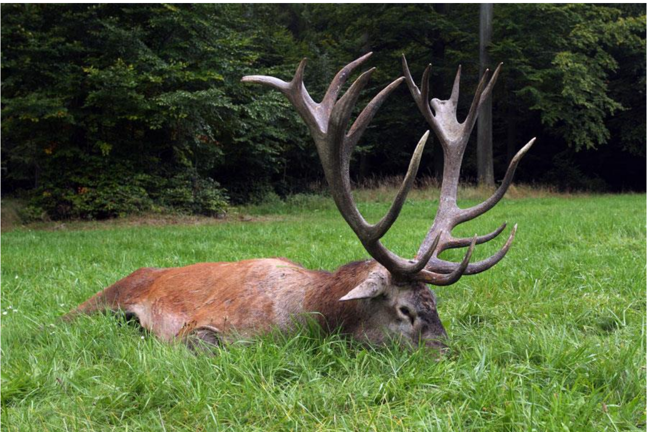
RED DEER 244,47 CIC POINTS (2014)