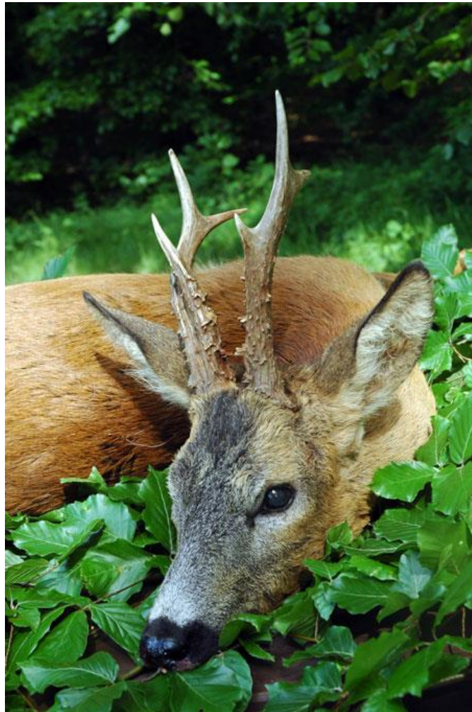
ROEBUCK HUNTED IN 2014