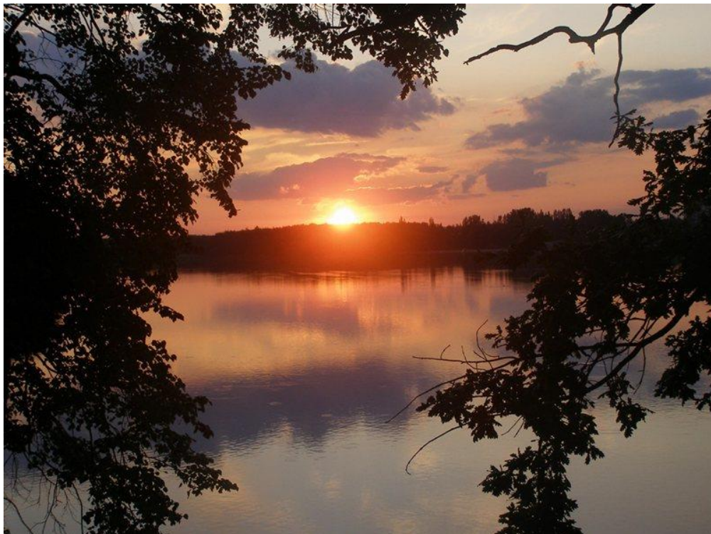
Sunset on a fishing pond

invited to Třeboň by Vilém of Rožmberk were able to prepare a potion guaranteeing the birth of a descendant. He died childless and his younger brother Petr Vok inherited his vast estate, but also his debts. He gradually sold several family residences and moved with his entire court to Třeboň, which he got rebuilt in Renaissance style for his comfort and the storing of a unique archive and collections only commensurate with collections of the Emperor Rudolf II at the Prague Castle. Renaissance chambers of the Rožmberk nobility and rooms of courtiers and ladies-in-waiting give us the image of the life in noble courts of those days, for example of the rules for the art of fine dining and feasting. During holidays it is possible to visit the stables, kitchen just for dogs and underground casemates which were converted into wine cellars later on. Also the tour of the remarkably furnished private suites of the last owners, Schwarzenbergs, is possible. As for the Třeboň carp, there are more than 500 lakes in sixteen connected networks in the city's surroundings.