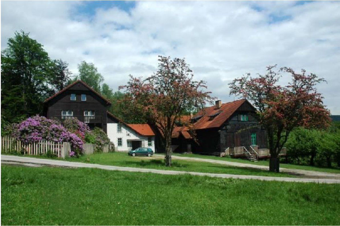
Hunting Lodge in Game Preserve N. 2

A very pleasant accommodation is assured by a hunting lodge with 18 beds, guest houses and hotel-chateau near the hunting grounds (up to deluxe level). The accommodation prices in the hunting structure's hotel facilities are the following ones.