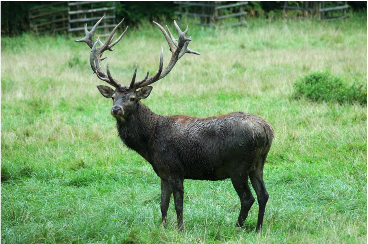
A Red Deer in Game Preserve N. 1