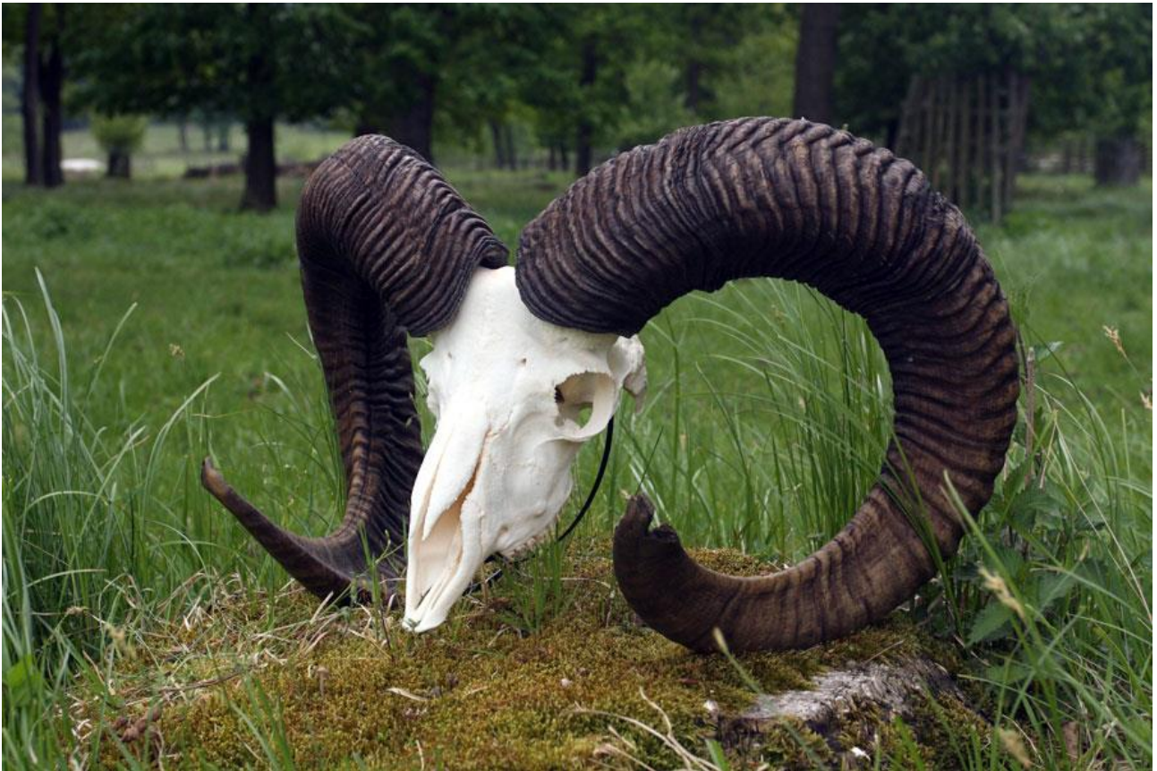
MOUFLON 226,20 CIC POINTS (2012)