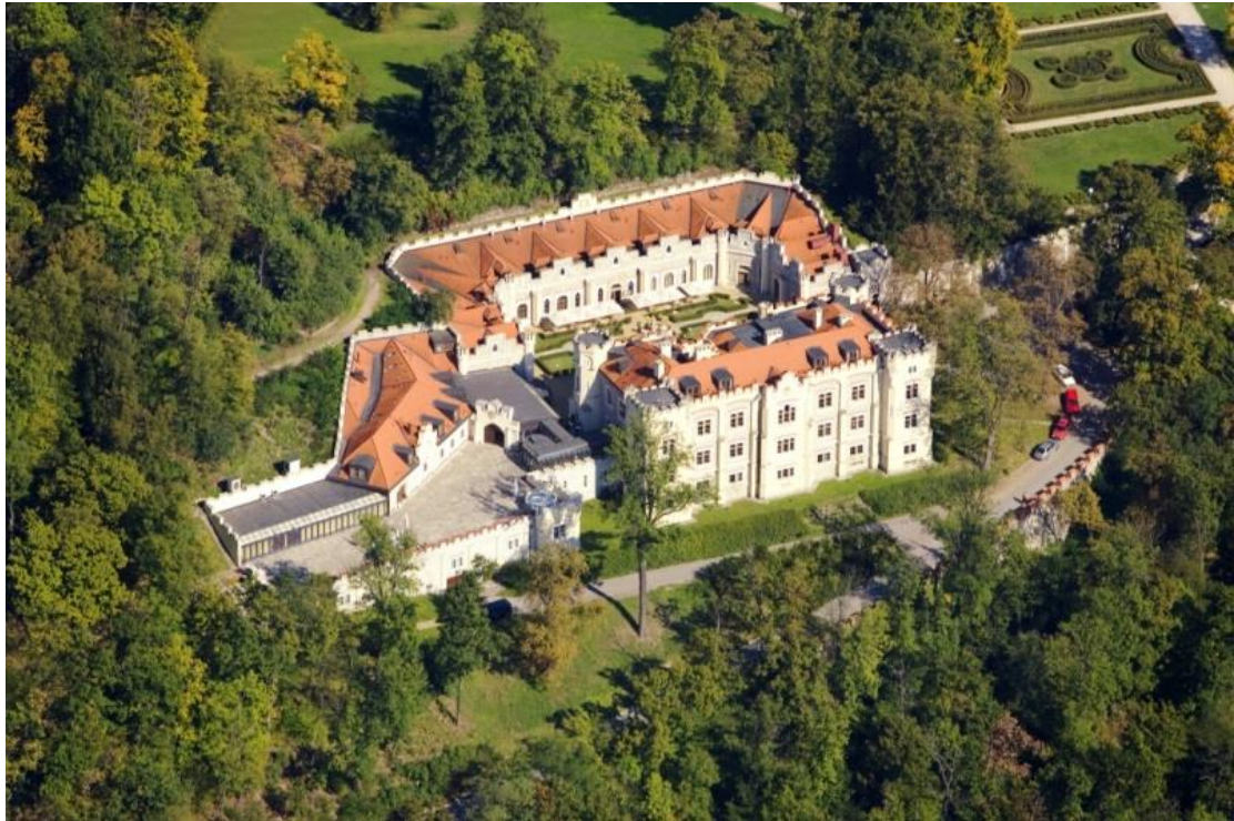
CHATEAU NEAR HUNTING GROUNDS