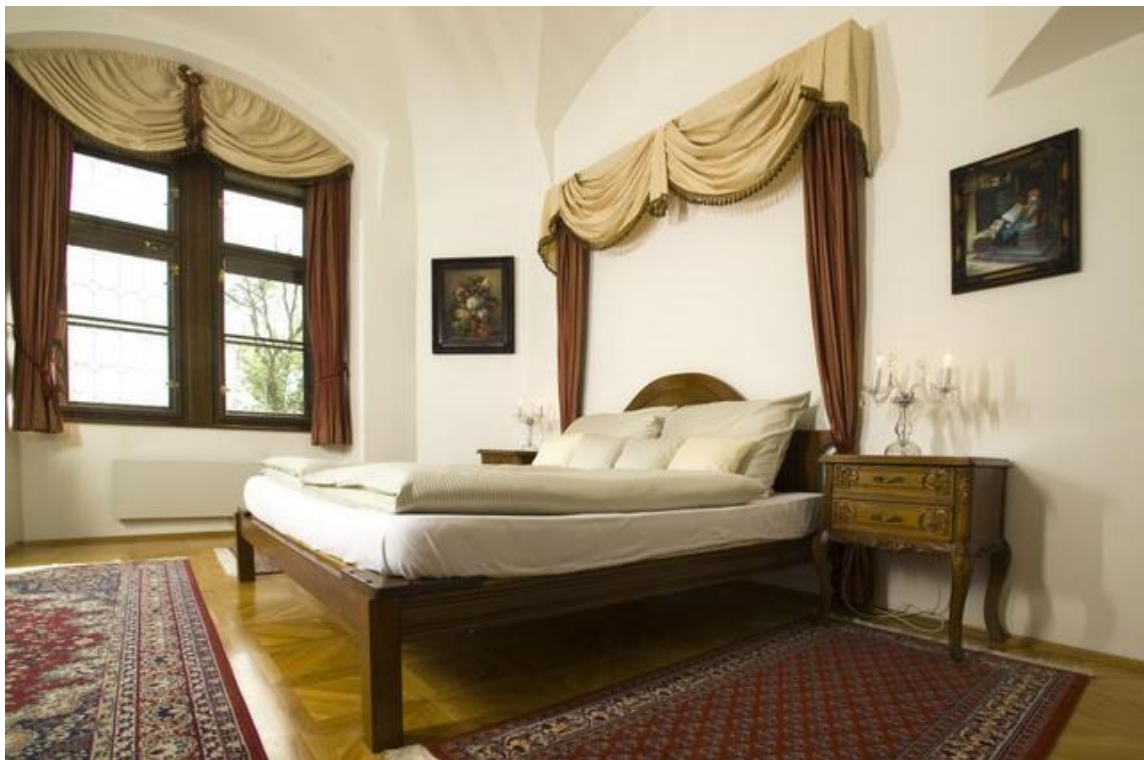
A ROOM OF CHATEAU