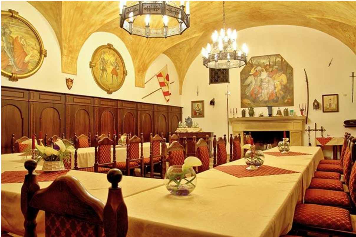
DINING ROOM OF 5 STAR HOTEL