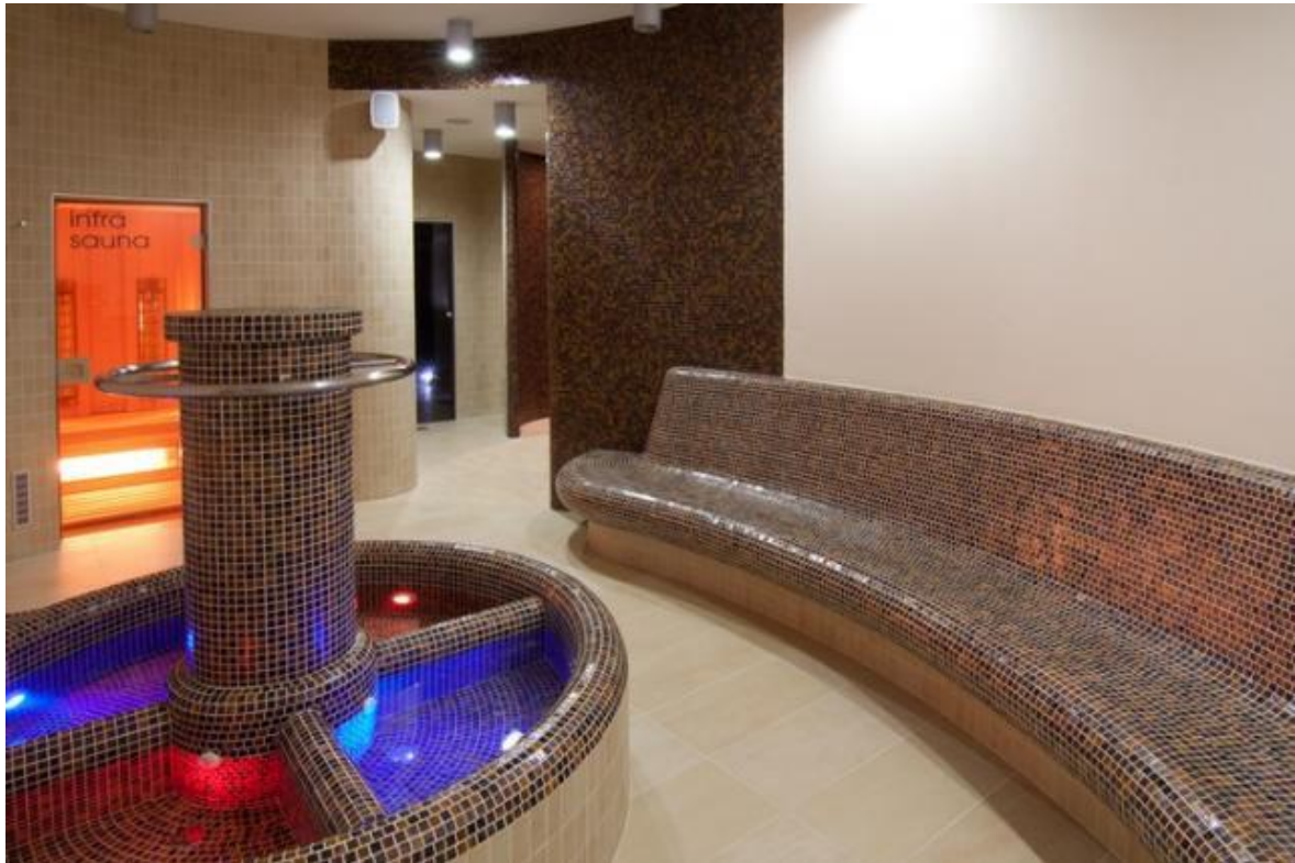
SPA IN 5 STAR HOTEL NEAR HUNTING GROUNDS