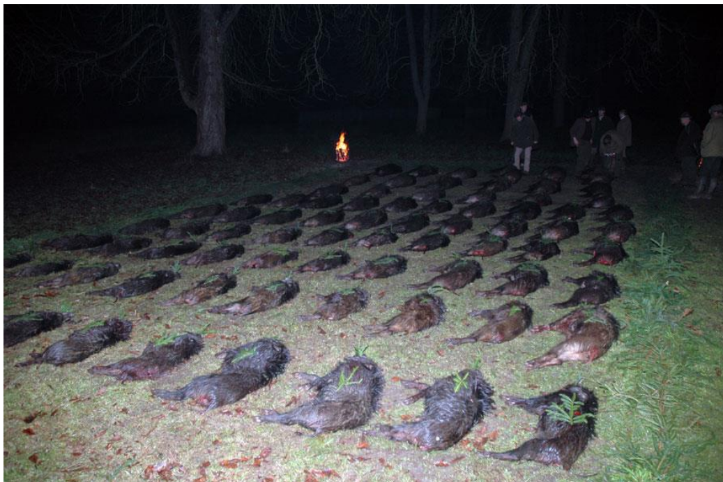
WILD BOAR DRIVEN HUNT DAILY GAME BAG 2014