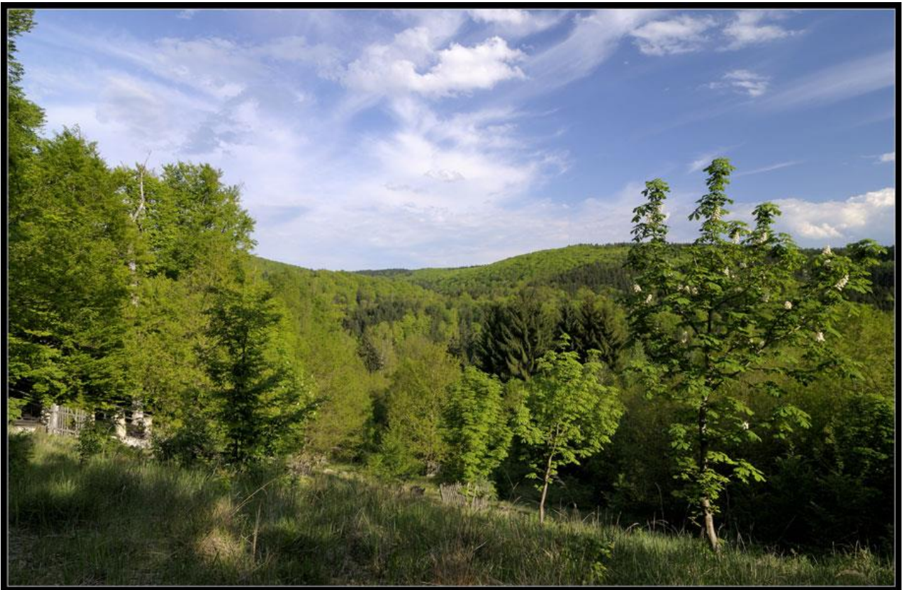
Hunting Area Landscape