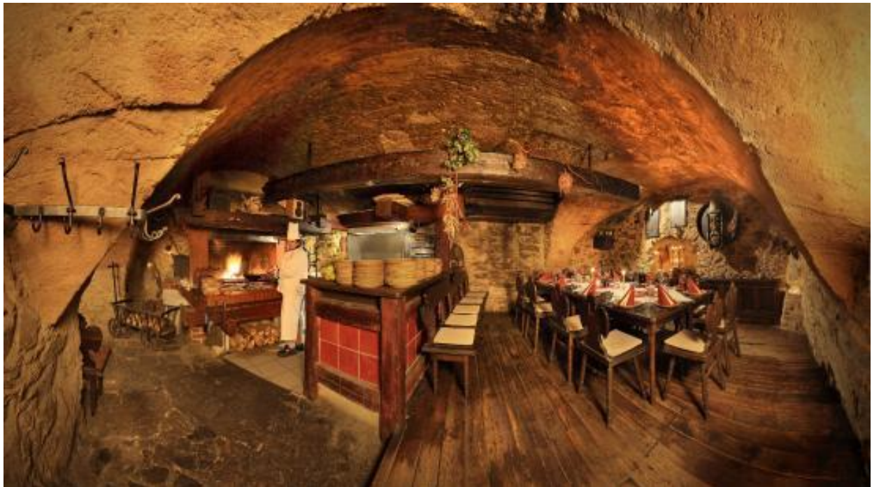
RESTAURANT WITH A MEDIEVAL SETTING