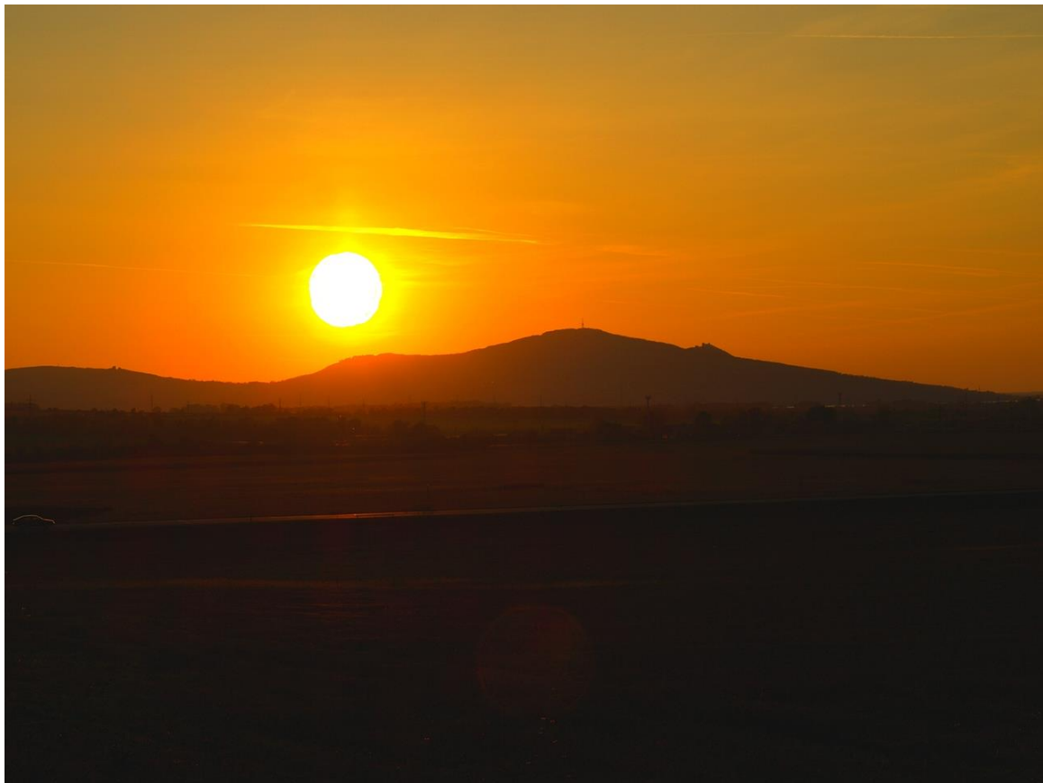
Sunset in Pálava

serve as a geology textbook. Do you like panoramic views of beautiful landscapes? Then be sure to head to the top of the Martinka limestone wall, which rises above Horní Věstonice. Meanwhile, a large flock of screeching jackdaws circles overhead – by now an integral part of the landscape. Your steps should also take you to the ruins of the Sirotní (Orphan) Castle, to which many romantic legends are ascribed. It is definitely worthwhile to come here in the evening, when the setting sun paints the castle and the rocks with beautiful colours.