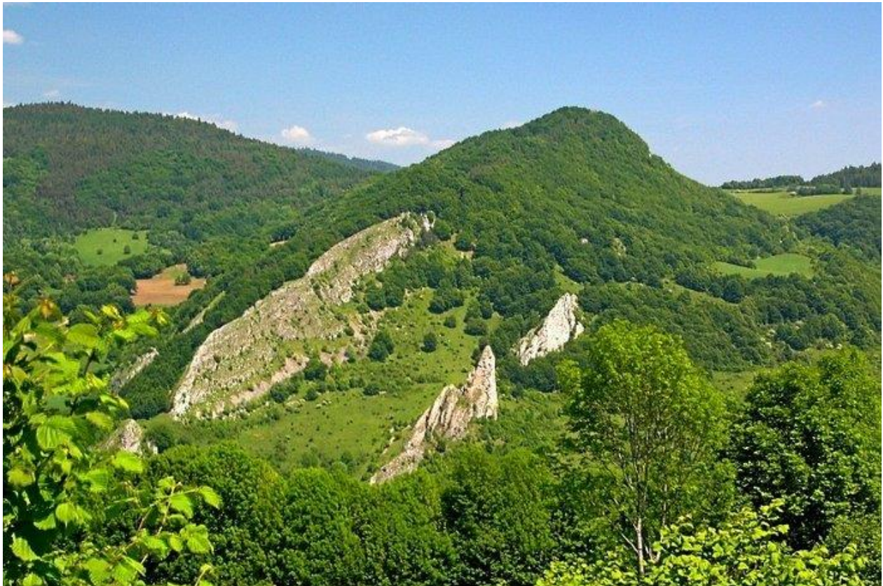
Landscape on White Carpathians

in development of this VIP hunting area. His immense passion for hunt and intense emotional connection with South Moravia moves business point of view to the background. He takes pride in verifying that client is completely pleased with his stay, during which time client was able to hunt in a beautiful natural scenery, be acquainted with old czech hunting traditions, appreciate excellent good food and wine, relax in the spa and much more. The basic goal of a stay in this hunting area consist in experience a modus vivendi characterized by living in close contact with nature, slowly tasting pleasures that life offer to us and feeling in harmony with ourselves and the world.