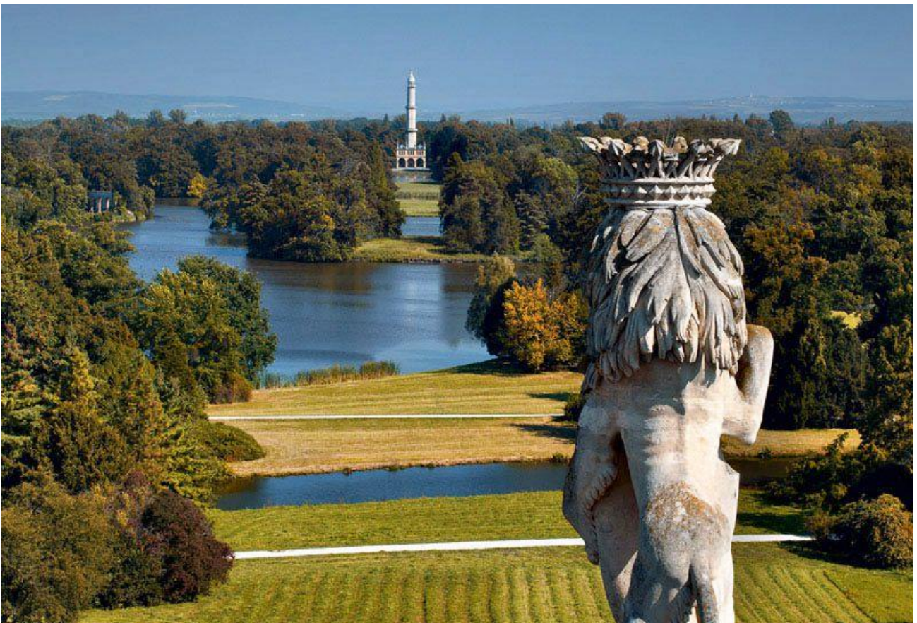
Lednice Park and Minaret

The other chateau – Valtice – was the spectacular residence of the Austrian and Moravian Lords of Lichtenstein. It is known not only for its beauty, but also the long tradition of winemaking. Grape vines were brought here by the Roman legion of Emperor Marcus Aurelius, who regarded the area of Pálava as suitable for cultivation of wine. You can thus enjoy not only a unique cultural experience, but also a glass of superb Moravian wine in the Wine Salon here. The park here, surrounding both chateaux, is one of the most luxurious landscapes in Europe.