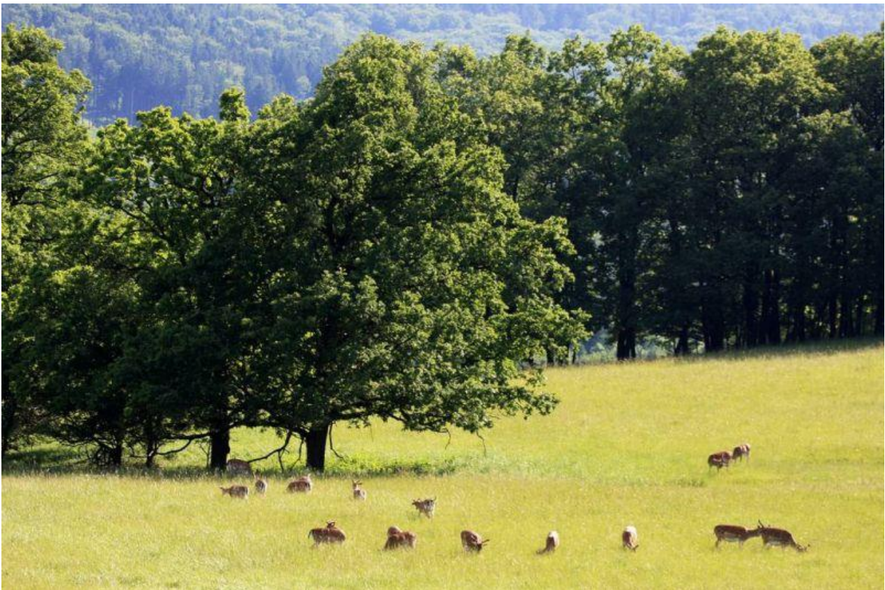
Fallow Deer in the game preserve

Let us to invite you to one of the most beautiful game reserves in the Czech republic. It located in South Moravia, to be more precise on the border with Slovakia, in the south-east corner of the picturesque White Carpathians Protected Landscape Area. This deer park - with an extension of 1565 ha and an elevation of 300-580 meters above sea level - is one of the biggest game preserves in the Czech republic. Most of the hunting grounds are covered by deciduous forest, mainly beech and oak, with spruce mixed in. White Carpathian meadows form the heart of the game preserve. Various kinds of orchids grow in these meadows, which cover an area of approximately 200 ha. The entire game preserve is located in the Natura 2000 European conservation area and includes also three ponds with a total area of 2.5 ha that can be used for fishing.