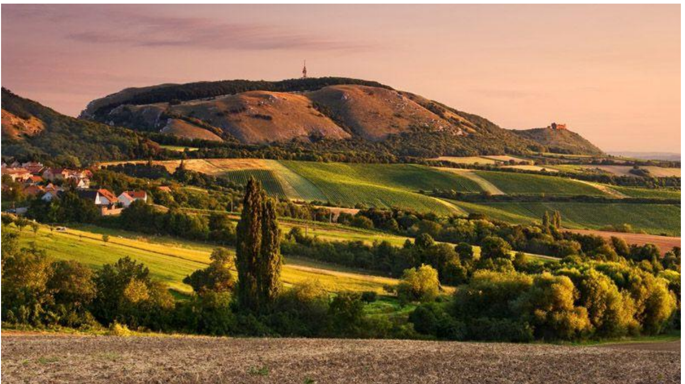
Pálava – Devín Mountain

There are places on Earth where you simply feel as if you are in paradise. The South Moravian region of Pálava, which is a part of UNESCO Lower Morava Biosphere Reserve, is undoubtedly one of those places. Visit this beautiful landscape of dazzlingly white rocks, blossoming meadows, lowland forests, romantic ruins of medieval castles, crystal-clear lakes and sun-drenched vineyards. All of this in a region that has one of the warmest climates in the Czech Republic and offers excellent opportunities for hiking, cycling, water sports and dining which you will remember for a long time to come.