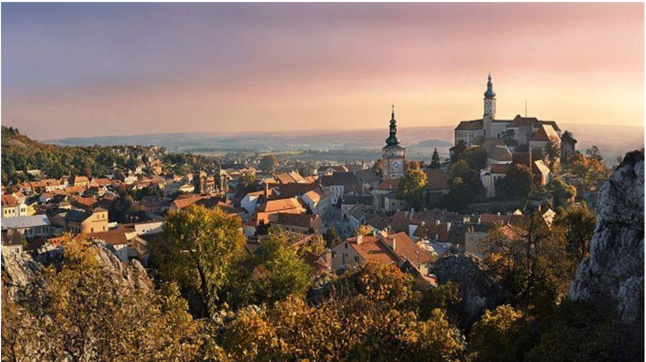
Mikulov and its castle

the visit also includes the historic chateau cellar with expositions of traditional viticulture. The huge richly decorated Renaissance wine cask with a volume of 101,400 litres and weight of 26.1 tonnes is the largest one in the Czech Republic. The Museum expositions represent, in addition to the local viticulture, the history of the chateau and the aristocratic family of Dietrichsteins, archaeology and attractive seasonal exhibitions.