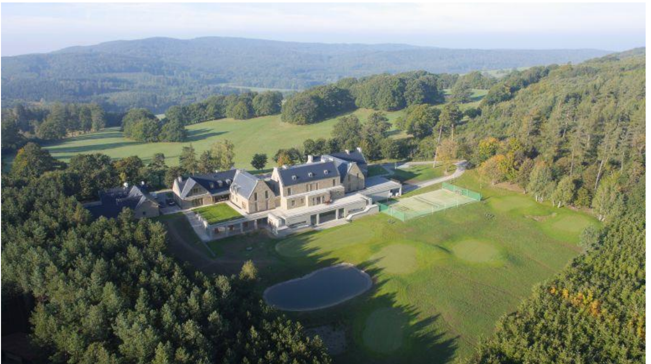
Aerial view of the main residence in the hunting area