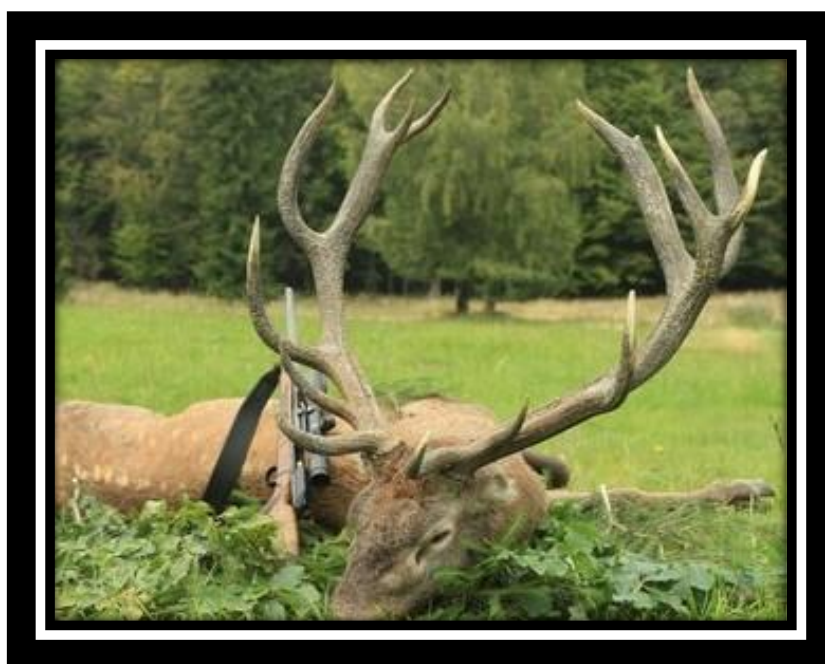
Nice gold medal stag hunted in 2017 by hunter from UK