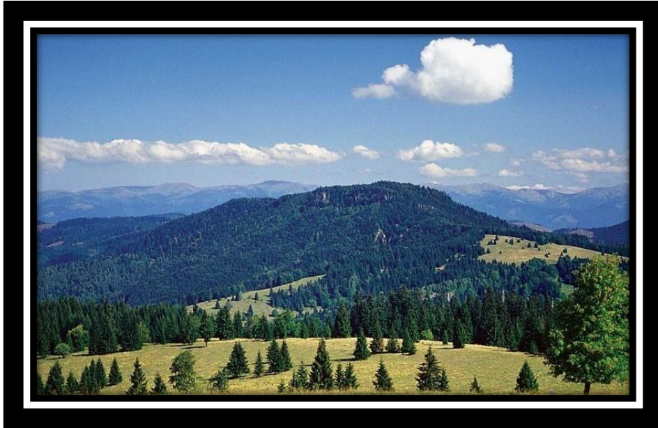
View of one hunting area in Central Slovakia