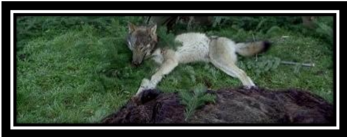
Wolf hunted in 2016 in hunting area in Northern Slovakia