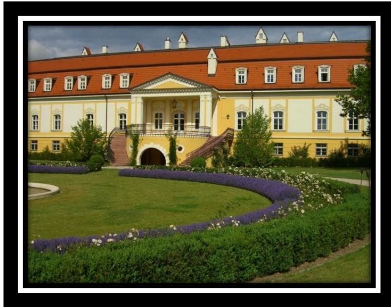
Historical Chateau in Central Slovakia

We can provide comfortable accommodation in hunting lodge or Hotel (starting from a cheap family Hotel to a deluxe 5-star Hotel-Chateau. Prices starting from 30-40 € per person per night with breakfast.