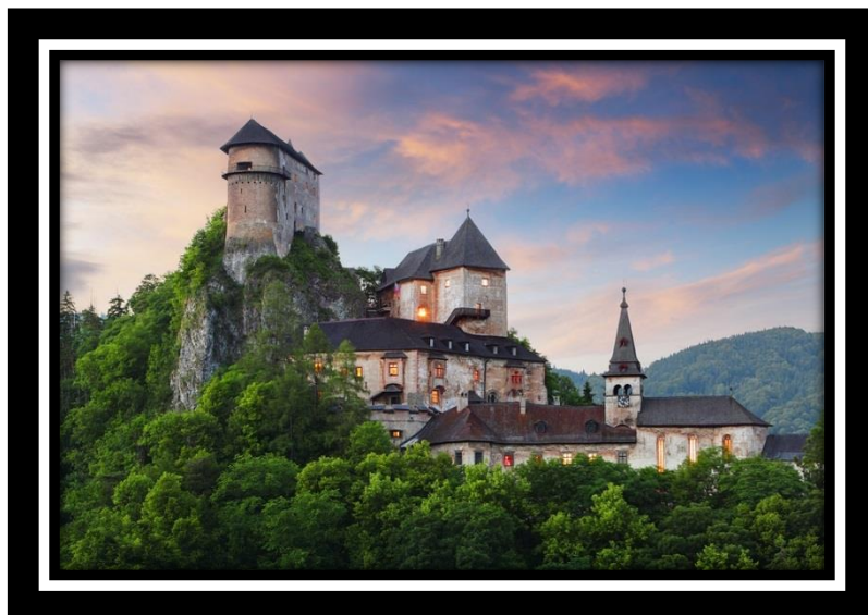
Old castle in Northern Slovakia

On demand we arrange a tourist package for hunters and non-hunter guests with sightseeing of the natural, historical and architectural gems of Slovakia.