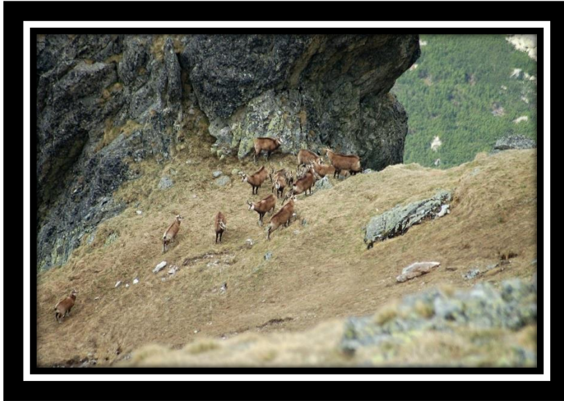
Chamois on Mountains in hunting area in Eastern Slovakia