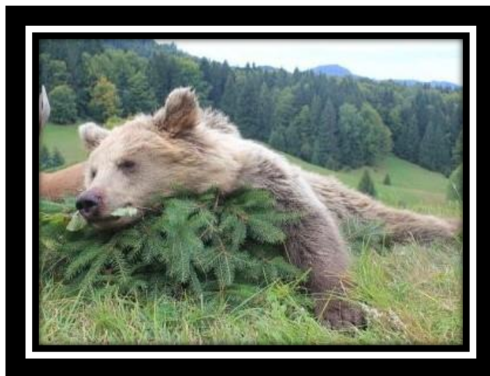
Bear Hunted in hunting area in Central Slovakia