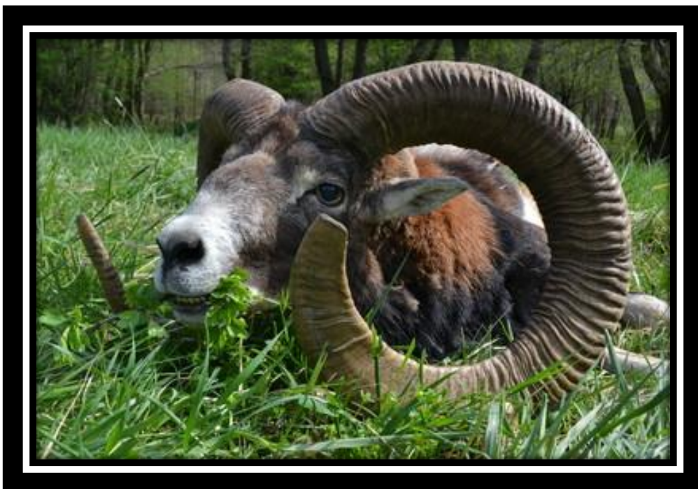
Gold medal mouflon hunted in 2017 – Western Slovakia