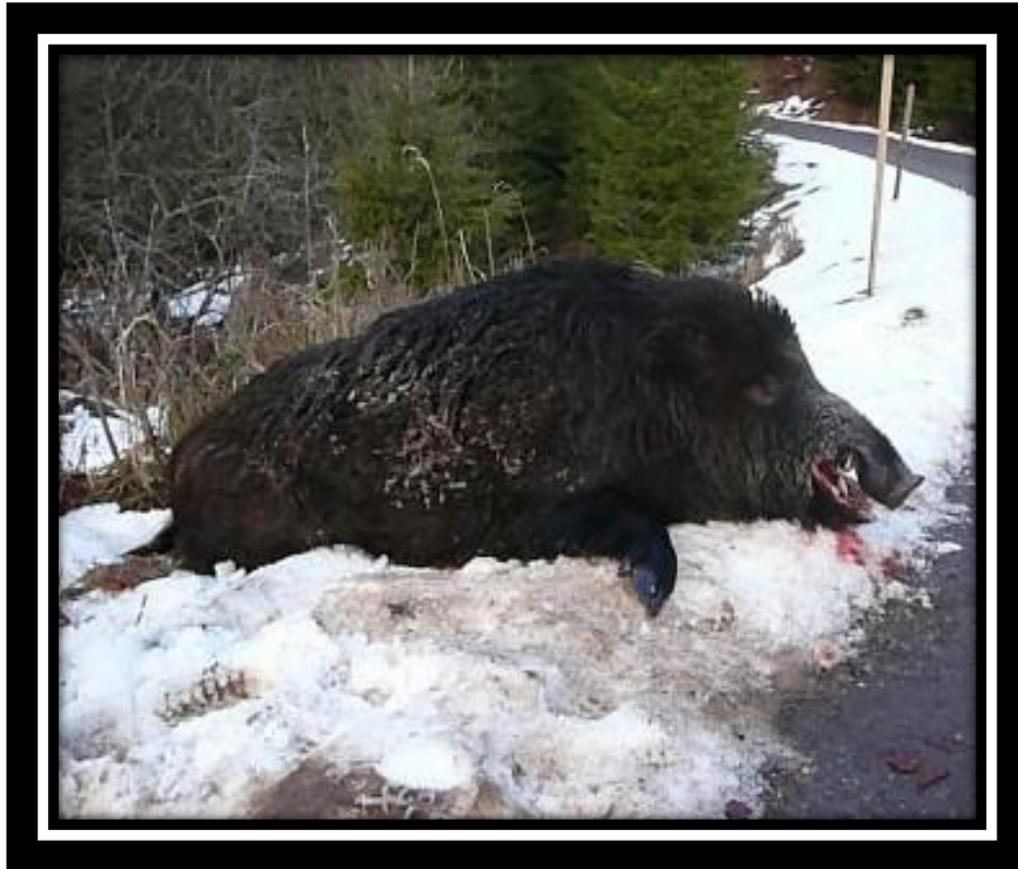
Tusker hunted in hunting area in Southern Slovakia

Sow and tuske: 16.07 – 31.12 (16.07 – 31.01 in fenced areas)