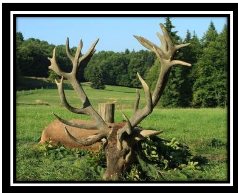
Outstanding gold medal trophy from hunting area in Central Slovakia