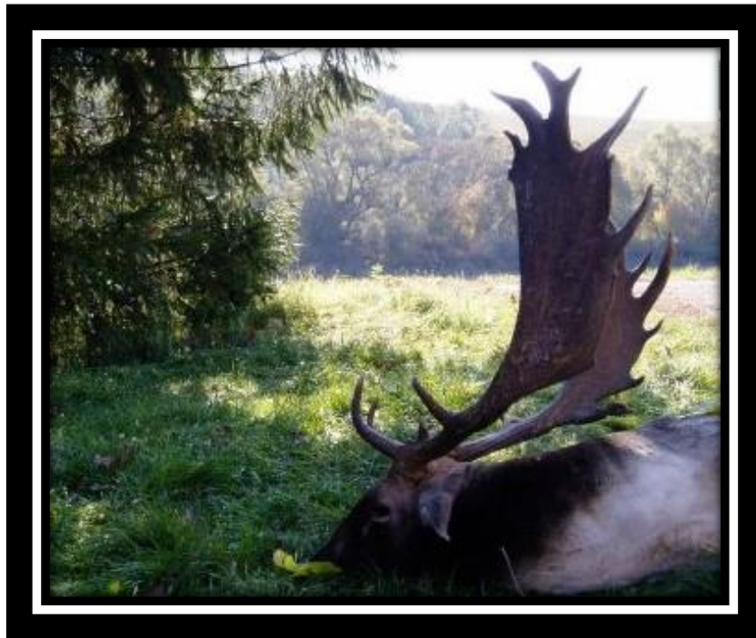
Nice Fallow Buck hunted in fenced area 1000 hectares